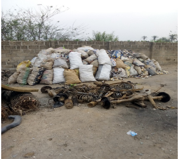
Figure 2. Showing rubber and metal waste that have been sorted out for recycling or trade