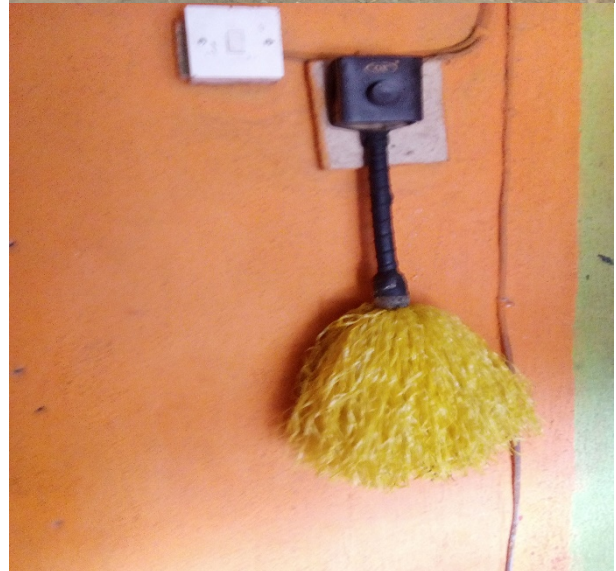
Figure 3. Showing leather waste and a sample of hand brush made from recycled waste materials

Furthermore, another interviewee affirmed that: